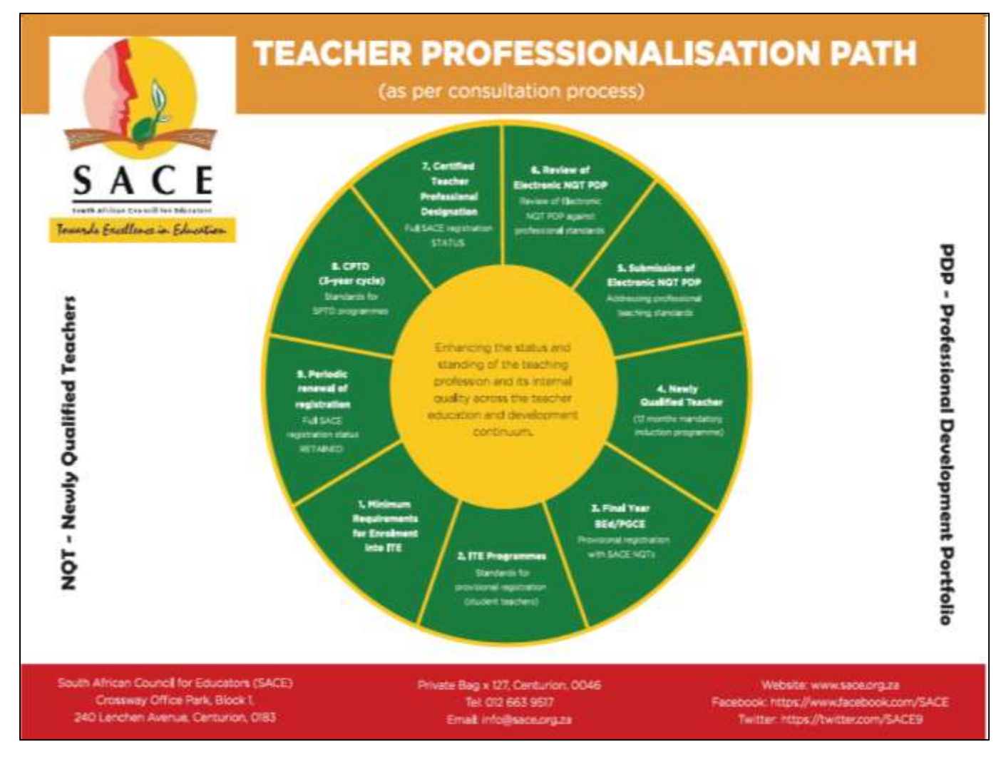
Figure 1 :Council-Approved Teacher Professionalisation Path Across the Teacher Education and Development Continuum.

As part of enhancing the status, esteem and prestige of the teaching profession across the teacher education and development continuum, the SACE commissioned a research on Teacher Professionalisation in 2015 - 2016. The research process involved the SACE stakeholders and employers in the basic and higher education sectors and teaching profession. One of the key research outputs was the Teacher Professionalisation Path ( reflected in figure 1 below ) which has been consulted on extensively, in terms of its development and design, and approved by council in principle.